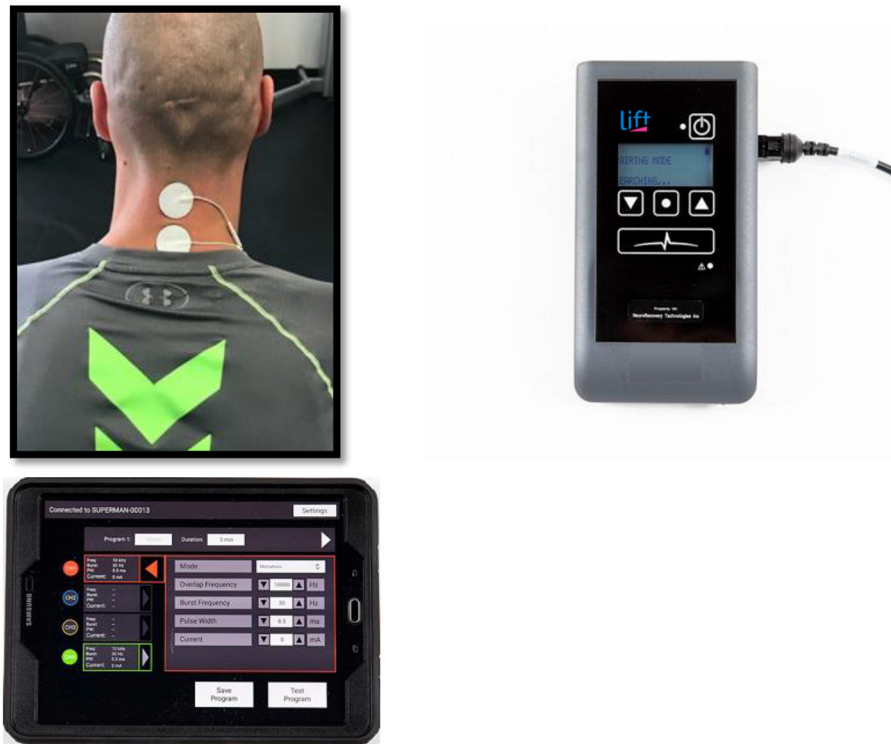
FIGURE 1 | Transcutaneous electrical spinal cord stimulation set up at the cervical spine for one representative participant.

adjusted to a level that provided optimal functional movement for that specific activity.