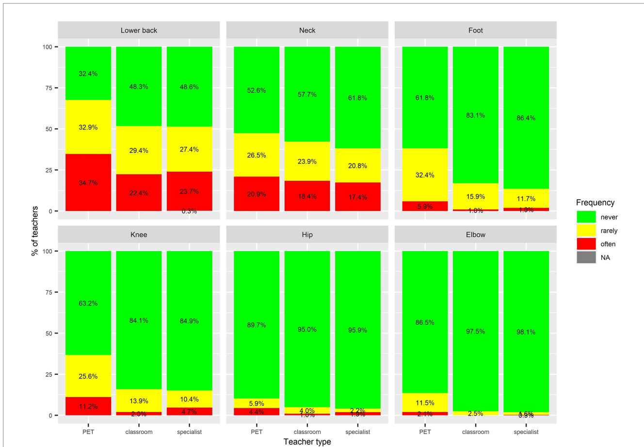
FIGURE 2 Basic statistics on musculoskeletal problems among teachers in the last 12 months. Values for Hip problems in specialist teachers: 2.2% rarely and 1.9% often. Values for Elbow problems in specialist teachers: 1.6% rarely and 0.3% often.