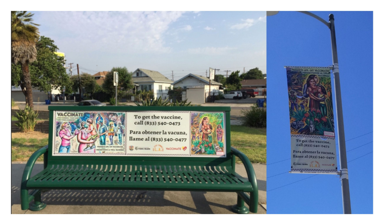
FIGURE 1 Stay connected Los Angeles outdoor campaign