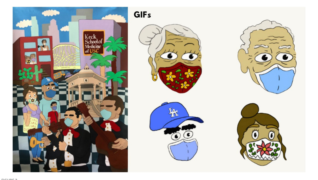
FIGURE 2 Social media GIFs and artwork created by Aaron Gonzalez.