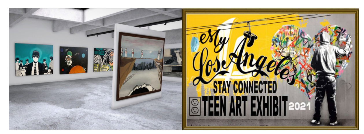
FIGURE 5 My Los Angeles Teen Art Online created by Ramona Gardens and Estrada Courts boys and girls club students.