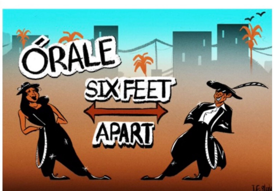
FIGURE 4 Spanglish/Bilingual cartoon created by J.E.