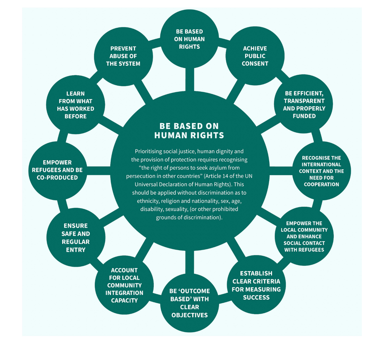
FIGURE 2 Key components for an alternative asylum system proposed by the Commission of the Integration of Refugees (the figure is interactive and can be accessed here: https://refugeeintegrationuk.com/our-mission/).

health among asylum seekers and refugees, they need to be grounded in a participatory approach. That is, assessments of needs, development of meaningful and diverse support mechanisms, and monitoring and evaluation of such supports must involve various stakeholders, including asylum seekers and refugees, communities hosting them, employers and educators, housing associations, social workers, health providers, and policy makers among others (35). Inspired by principles of participatory action research, such inclusive working should be based on (1) social change to enable action that leads to systemic, social, and behavioral changes; (2) participation that ensures that the agenda is driven by those who have a stake in the issue; (3) power of knowledge whereby knowledge is carefully and purposefully produced with diverse stakeholders; and (4) collaboration by expanding the emphasis from action and change to collaborative policy making and service provision starting with program planning and including