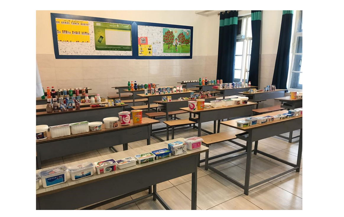
FIGURE 2 The food products used for the study.