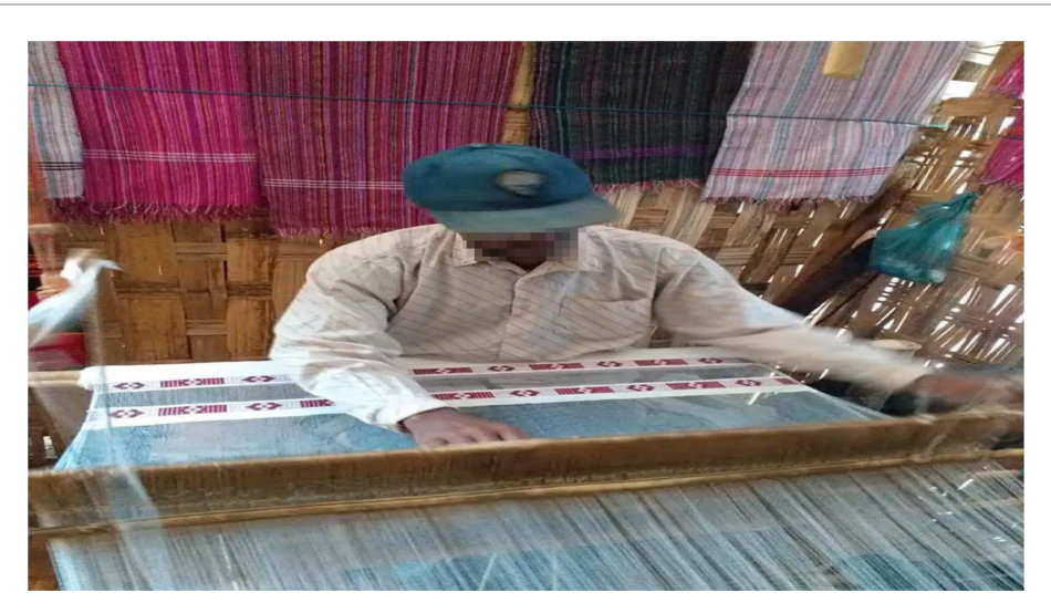
FIGURE 3 Working with the trunk bent for longer duration.

and workload, and the desire to earn more money drives weavers to work longer hours. Furthermore, the long working hours cause fatigue of the physical endurance of the muscles and bones, resulting in low back pain (32). This study, however, contradicted previous research conducted among textile industry workers in Pakistan, weavers in Varanasi, India, and weavers in Pathrail union in Tangail district, Bangladesh, which discovered that working hours were not significantly associated with the occurrence of low back pain (30, 38, 39).