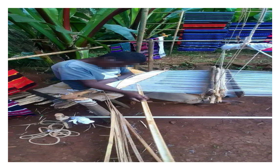
FIGURE 4 Working using a variety of posture including forward flexion and side bending

than those who did not work in an uncomfortable posture to report LBP (AOR = 2.07, 95% CI: 1.23, 3.49). Given that weavers used to weave for long periods of time while seated, with a stretched, extended body and repeatable movement, the outcome is not surprising. Furthermore, several studies among weavers discovered that bending, twisting, and static postures that put pressure on the back were risk factors for LBP (22, 24, 42). Weaving looms, for example, have a sitting arrangement with no cushion or back support, which weavers have reported as uncomfortable. It strains the lower limbs, calf muscles, and back (40, 42).