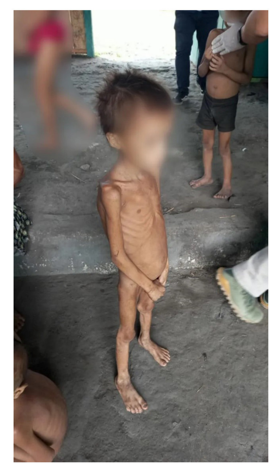
FIGURE 1 Yanomami child, visibly malnourished.

Da Luz Scherf and Viana da Silva 10.3389/fpubh.2023.1166167