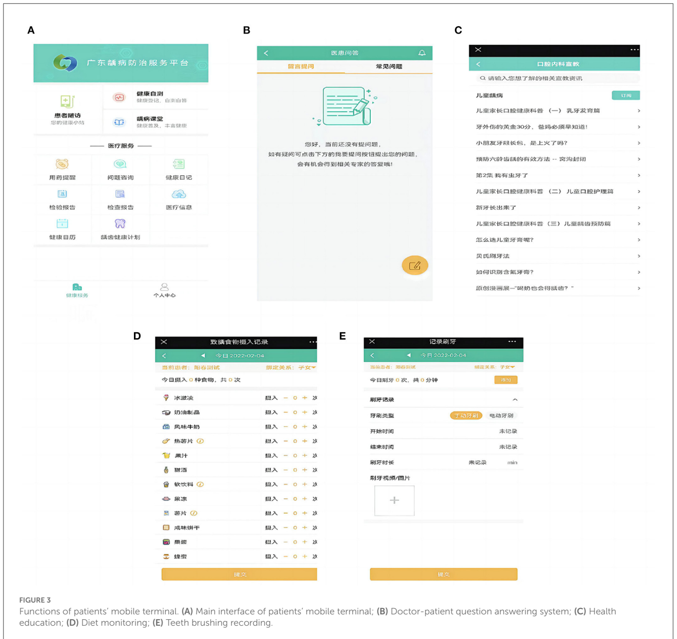
FIGURE 3 Functions of patients' mobile terminal. (A) Main interface of patients' mobile terminal; (B) Doctor-patient question answering system; (C) Health education; (D) Diet monitoring; (E) Teeth brushing recording.

pit and fissure sealing) with the same frequency as the experimental group, the researchers also conducted regular interventions for children in the control group in classroom, including oral health education, diet instruction, teaching children how to choose and use fluoridated toothpaste, education on brushing methods, and encouraging children with caries to seek medical treatment in time. The interval of interventions was every 3 months for those at high risk, every 6 months for those at intermediate risk, and every 12 months for those at low risk.