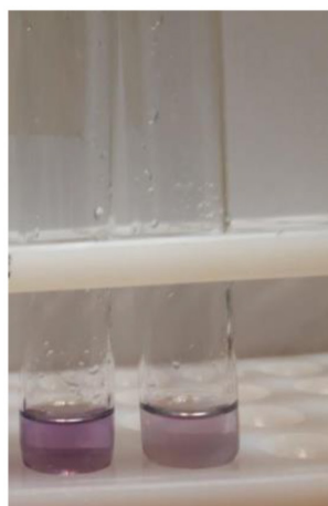
FIGURE 2 Two negative results.

less than the EU standard (safe). Figure 2 is an example of a negative reaction.