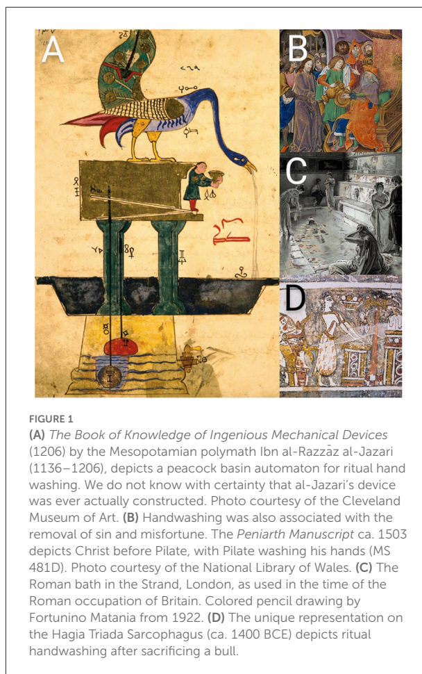
FIGURE 1 (A) The Book of Knowledge of Ingenious Mechanical Devices (1206) by the Mesopotamian polymath Ibn al-Razzaz al-Jazari (1136–1206), depicts a peacock basin automaton for ritual hand washing. We do not know with certainty that al-Jazari's device was ever actually constructed. (B) Handwashing was also associated with the removal of sin and misfortune. The Peniarth Manuscript ca. 1503 depicts Christ before Pilate, with Pilate washing his hands (MS 481D). (C) The Roman bath in the Strand, London, as used in the time of the Roman occupation of Britain. Colored pencil drawing by Fortunino Matania from 1922. (D) The unique representation on the Hagia Triada Sarcophagus (ca. 1400 BCE) depicts ritual handwashing after sacrificing a bull.

Prior to any genuine knowledge of cleanliness, and in addition to the religious and symbolic implications of