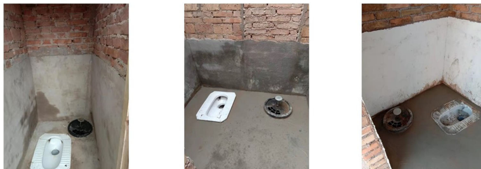
FIGURE 3 Examples of sanitation; photos provided by survey respondents.