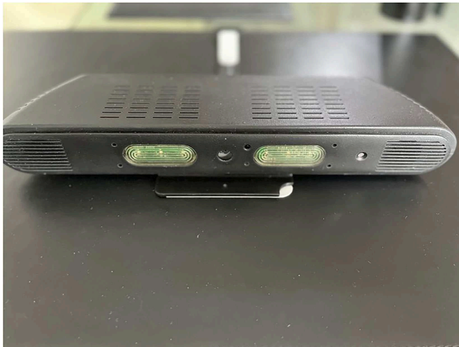
FIGURE 5 Kraydel Konnect first prototype.