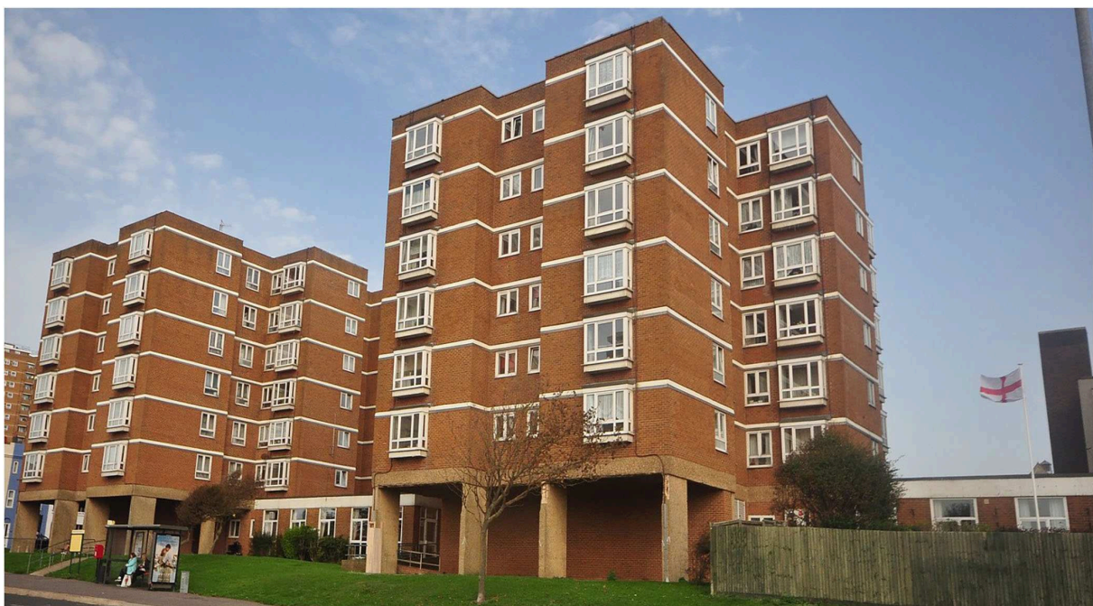
FIGURE 1 Digital health living lab.

The lab was the culmination of a national scheme, the Leading Places program, that had brought together the University of Brighton with Brighton and Hove City Council (39, 40). The Brighton project aimed to help develop strategies in self-managed care for older adults, for example, in the context of medication administration, self-monitoring and self-awareness, and self-management of the emotional impact of multiple comorbidities. Therefore, the team focused on a series of interventions for groups of people living in assisted sheltered accommodation to find ways to prevent or delay entry into more intensive and expensive care programs. The lab was developed as a response to address the difficult issue of evidence-based digital health supporting self-managed care and acting as a tool to be used by various stakeholders (41).