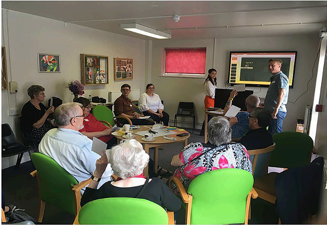
FIGURE 7 Co-creation workshop.