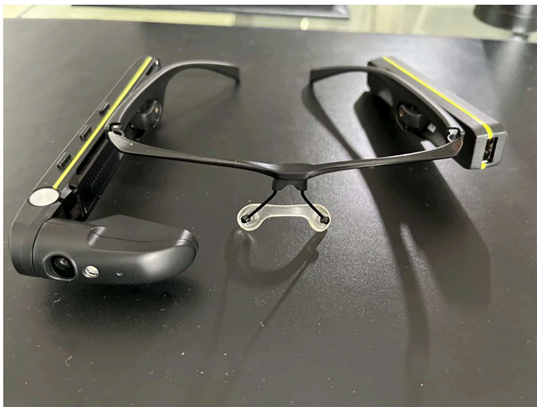
FIGURE 4 Smart glasses.

“no” from the specially designed remote control. Kraydel has several user-related features, such as the ability to respond to questionnaires and surveys through the TV, which can be used to gather user-related insights such as wellbeing assessments. Callers can use the Konnect app on their smartphones (available for iOS and Android) to make video calls to the user’s TV. The system also offers so-called sofa-to-sofa communication. For example, any individual (relative, carer, and healthcare professional) who has a Konnect unit can make calls to the user’s TV from their own Konnect unit as long as the user allows access in advance. Users can also upload photos from their phones and upload videos through a dashboard that can be viewed on the TV.