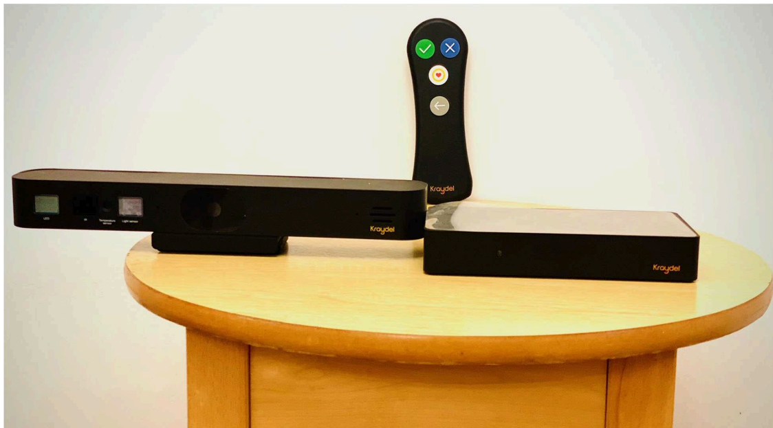
FIGURE 8 Kraydel Konnect updated version.