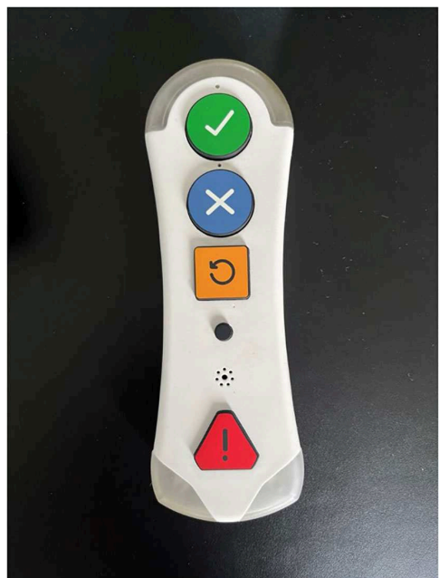
FIGURE 6 Kraydel Konnect remote control first prototype.