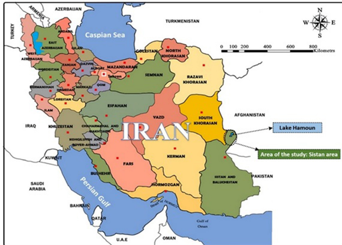
FIGURE 2 | The location map of Sistan area in Iran.

tourism; however, this epidemic has reduced greenhouse gas emissions in tourist areas (9).