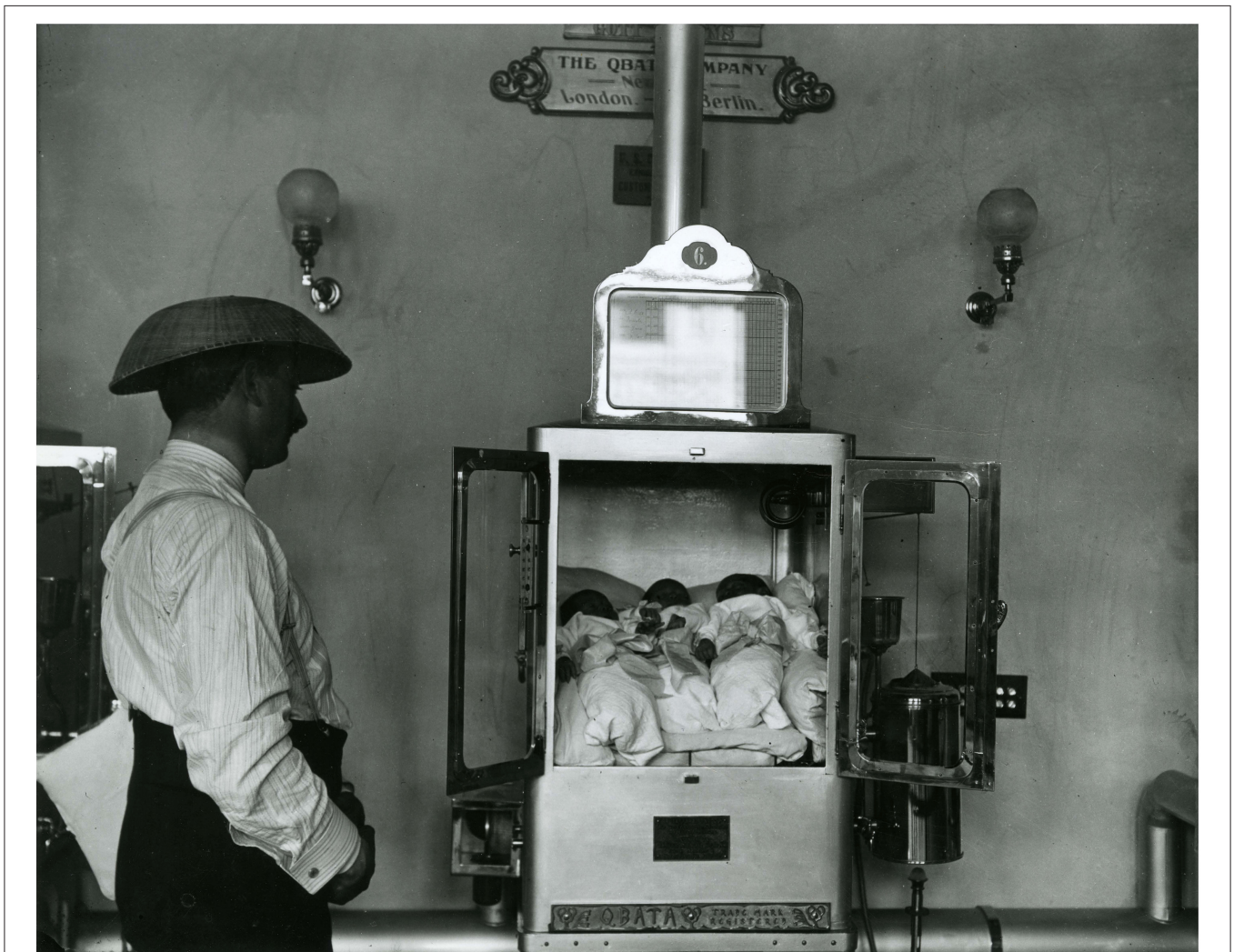
FIGURE 3 | History of Medicine: The Incubator Babies of Coney Island. Retrieved from: https://columbiasurgery.org/news/2015/08/06/history-medicine-incubator-babies-coney-island .

On a more experimental note, in 1957, the American neonatologist William Silverman started a series of large-scale randomized control trials assessing the causality between thermal care and newborn survival. These studies may well be the first randomized controlled trials in newborn care. Silverman's observations triggered the design of the first closed incubator including surveillance and servocontrol of the temperature (30, 31). High survival rates were independently reported for the Silverman incubator by three different studies performed in the following years (31). However, the subsequent commercialization of the device on a large scale led to the identification of an operational issue in terms of heat loss, such that the