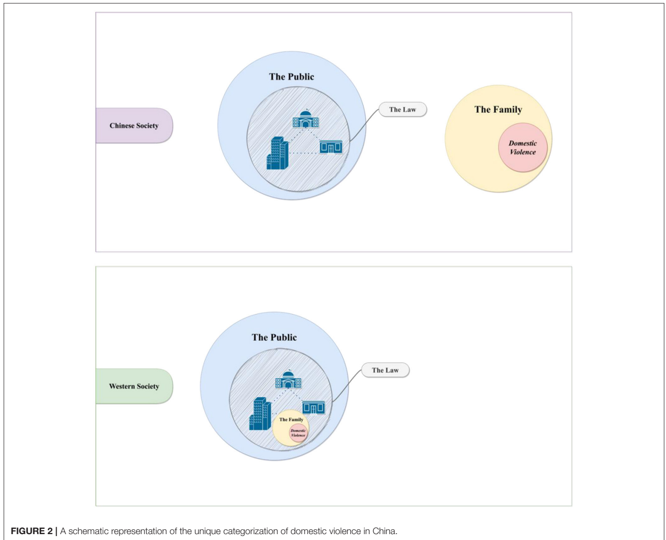
FIGURE 2 | A schematic representation of the unique categorization of domestic violence in China.

infrastructure that is available in developed countries such as the U.S. (56–58), critical intervention mechanisms that have the potential to help victims fend off the adverse impacts of domestic violence. These insights combined, in turn, further underscore the problematic nature of the research gap. Without essentials such as domestic violence crime reporting, monitoring, and surveillance, basic understanding such as what are the impacts of domestic violence on avoidable medical experiences, workforce productivity lost, and long-term social stability could not be achieved. Needless to say, without these understandings, government and health officials may not be able to evaluate, let alone prevent, the repercussions of domestic violence as an overlooked public health epidemic on the health and wellbeing of the society at large.