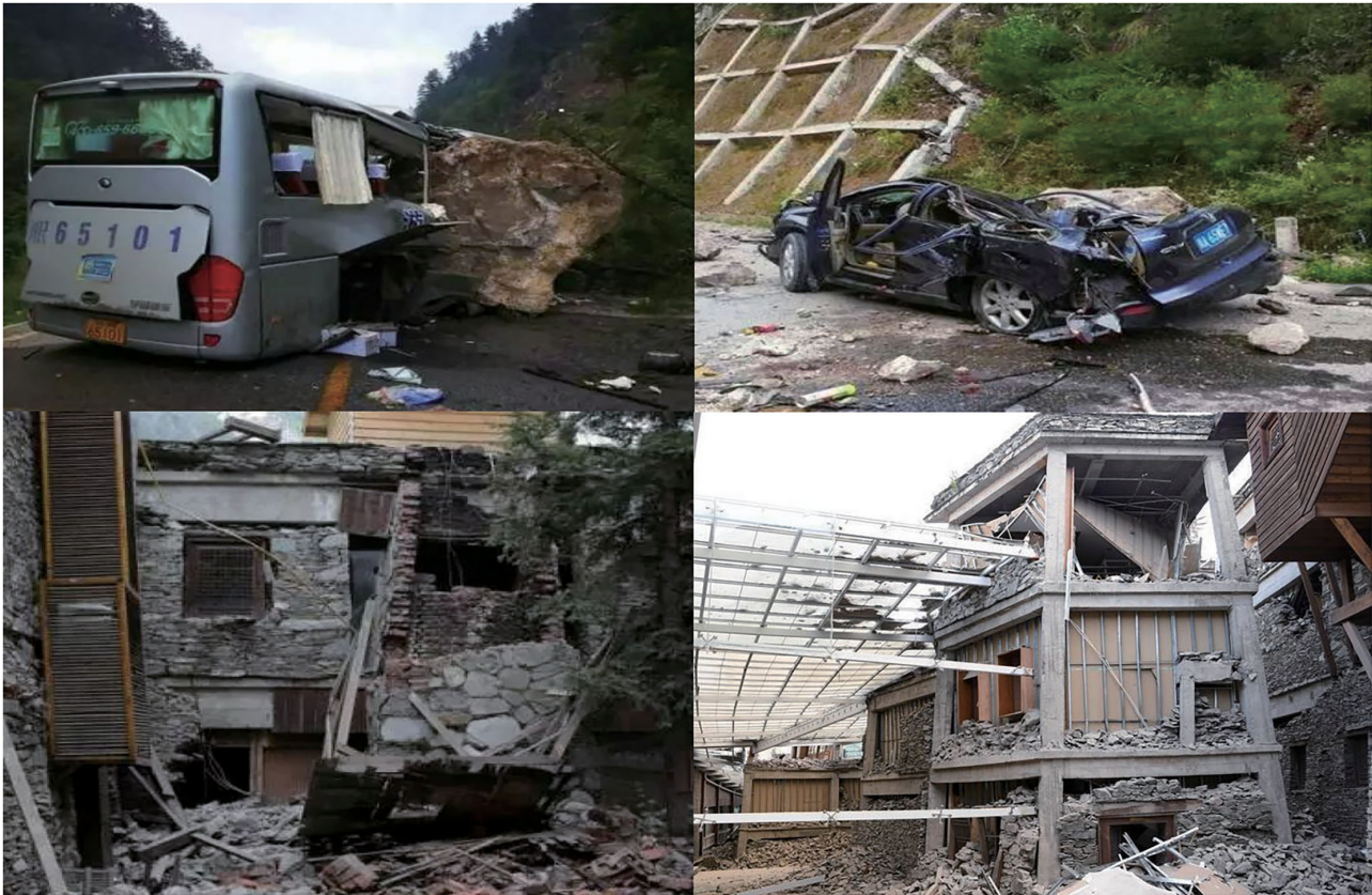
FIGURE 2 | Scenes in Jiuzhaigou after the earthquake.

we showed that there was a significant difference in ISS as well as in treatment when comparing Jiuzhaigou earthquake patients to Wenchuan and Yushu earthquake patients ( p < 0.05 ).