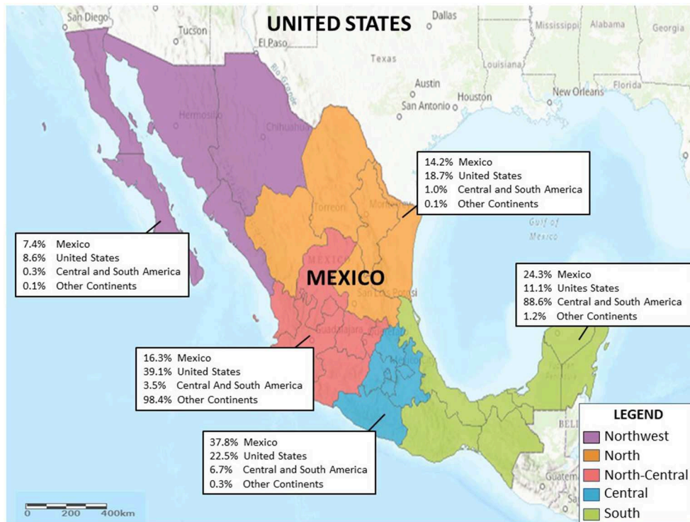
FIGURE 1 Proportion of hospitalizations by geographic region and habitual residence.