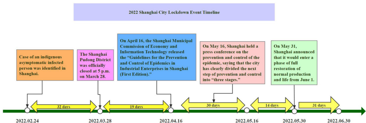
FIGURE 2 Timeline of the 2022 Shanghai lockdown based on the CERC model.

disseminate, and receive information involves understanding how the government or PHA develops and disseminates communication strategies related to COVID-19.