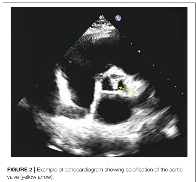
FIGURE 2 | Example of echocardiogram showing calcification of the aortic valve (yellow arrow).

Altogether, 2,756 patients with CKD stages 1–4 and with measurement of echocardiogram were included in the present study (Figure 2). Among them, the proportion of patients with CVC was 5.91%. Patients with CVC were significant older than those without ( P < 0.001 ). Prevalence of diabetes was significantly greater in patients with than without CVC ( P < 0.001 ). Patients with CVC had a higher prevalence of CVD than those without (29.82 vs. 11.23%, P < 0.001 ). Hemoglobin and serum albumin levels were significantly lower in patients with CVC compared to those without. BMI and