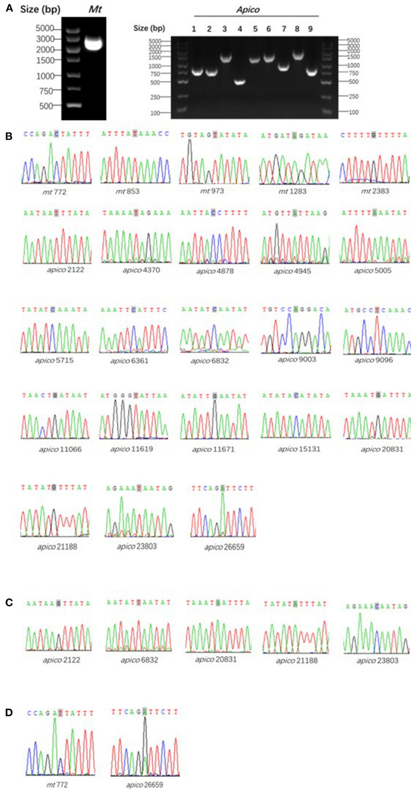
FIGURE 3 | Agarose gel electrophoresis of polymerase chain reaction (A) and sequencing wave of the target loci with wild-type (B), mutant type (C), and mixed type (D) compared to the reference Plasmodium falciparum 3D7. Gray shading marked in the sequencing waves indicates the target loci.