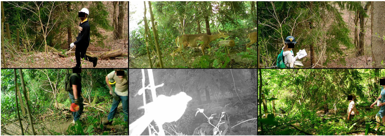
FIGURE 3 | Example images from passive infrared camera field test.