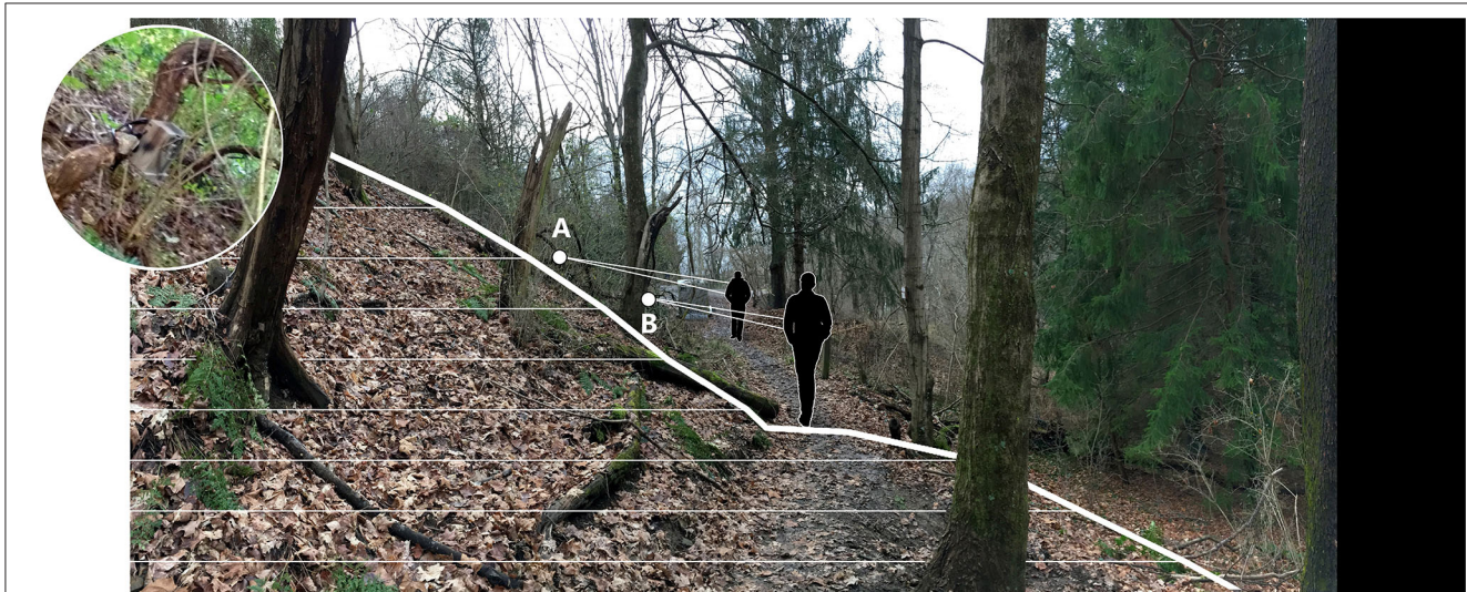
FIGURE 2 | Image depicting the field test location, looking toward the trail entrance, with the location of the PIC ( A ) and infrared trail sensor ( B ) noted. The PIC was 3 m from the trail edge and the sensor was 1 m from the trail edge. The inset photo is an image of the PIC mounted to sturdy grape vine at location ( A ). PIC, passive infrared camera. Bold line shows cross section of topography at infrared sensor location (foreground). Horizontal lines denote 0.6-m contours.