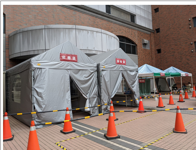
FIGURE 2 | Tents as “outdoor clinics”.