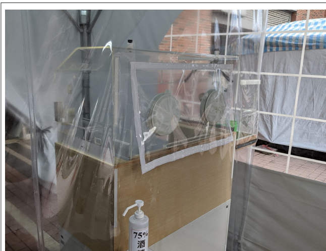
FIGURE 3 | Homemade “sampling shield” for nasal swab testing.