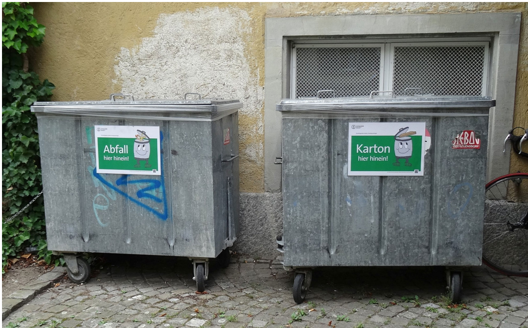
FIGURE 4 Structural measure: Second container to separate cardboard with signs 'garbage in here' and 'cardboard in here'.