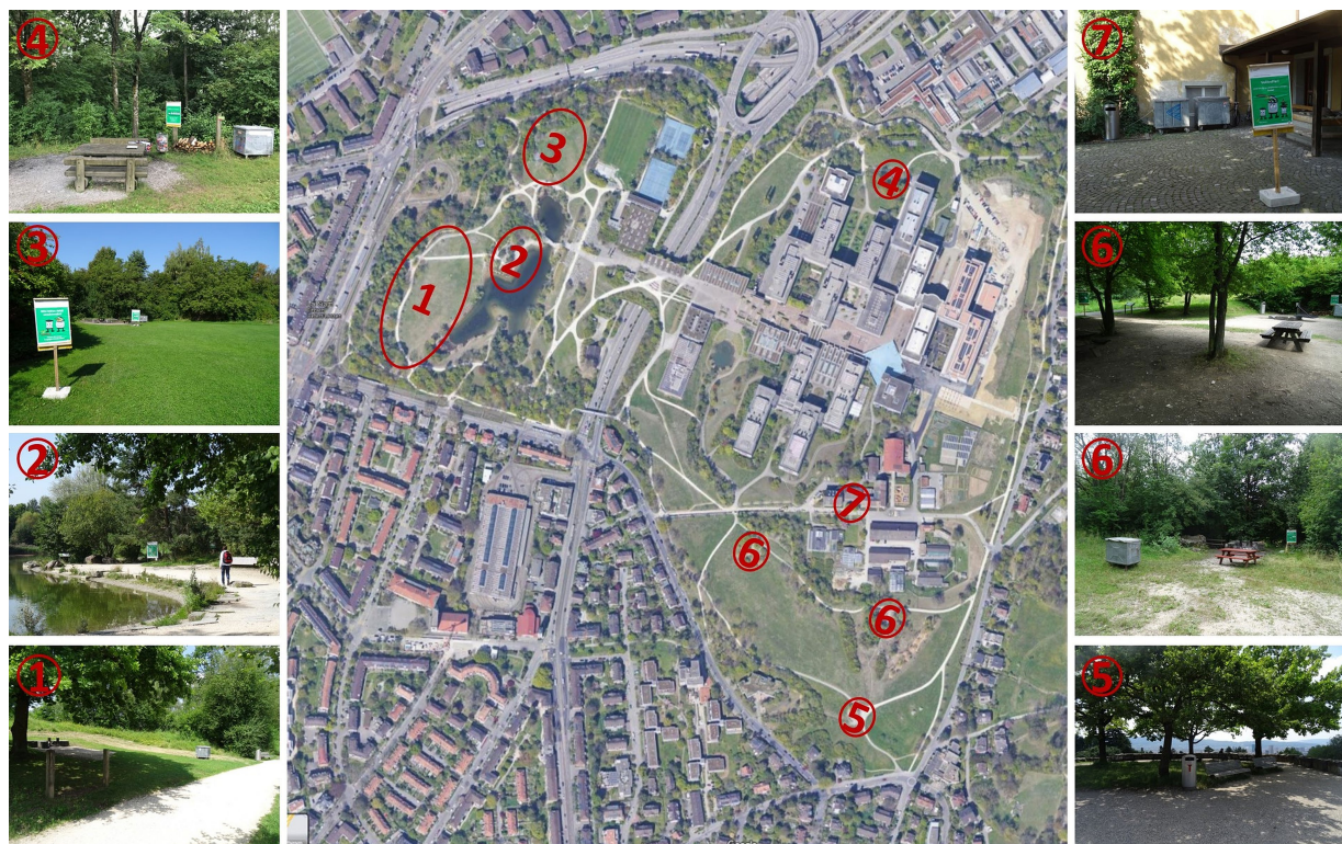
FIGURE 2 Study site (Irchelpark, source: Google Maps) with the investigation zones.

guests of Irchelpark dispose of their waste in the waste containers and would like others to do the same.”), NGr targets the reciprocity norm (“For you we clean the park – 4h a day. Thank you for the time you gave us by disposing of trash in the garbage bins. University of Zurich, Operational Service”). The information provided on these posters is based on a survey with park visitors in August to October 2018, and on information provided by the Operational Service.