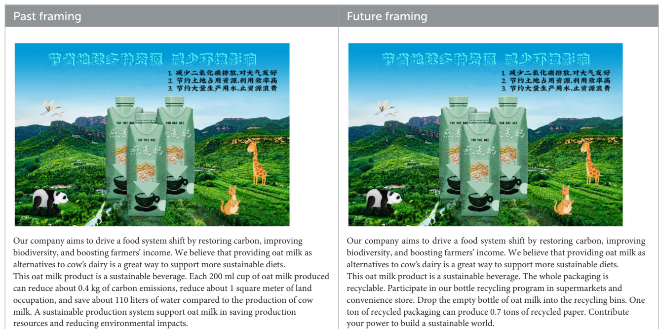
TABLE A2 Measurements.