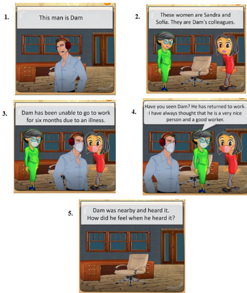
FIGURE 3 Illustrative Translation into English of a Theory of Mind (ToM) Exercise Generated with the Mobbty Application (for Children aged 15 and above).