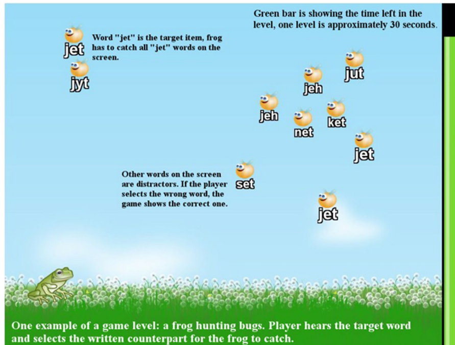
FIGURE 1 In the English GraphoGame the choosing of corresponding – here larger – written units to represent the one the learner hears from the headphone is occurring in this type of seen.