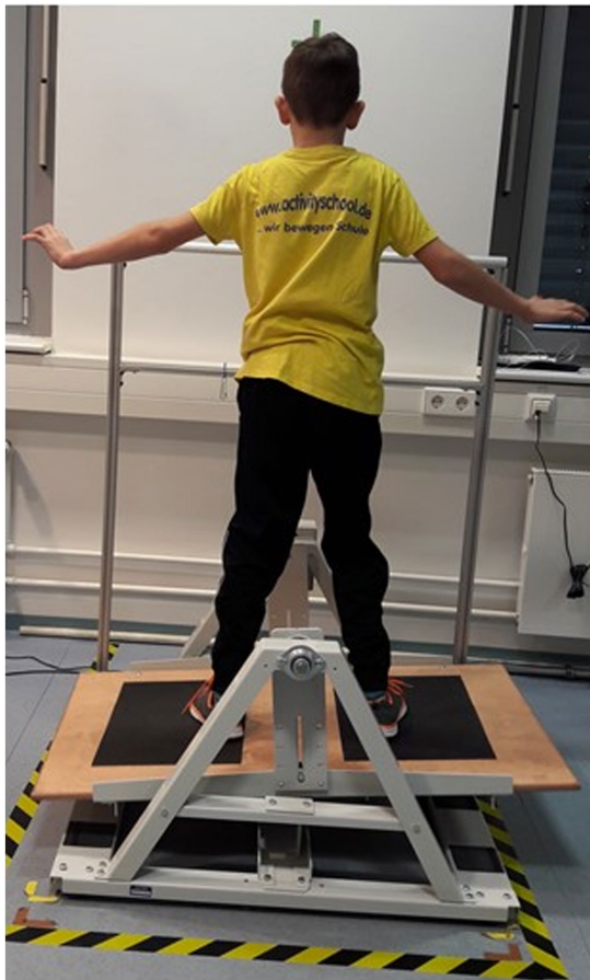
FIGURE 1 Illustration of a participant balancing on the stability platform (stabilometer). Participant's assent and parents' written informed consent were obtained to publish this figure.

while balancing on the platform for another three trials. For the transfer test, no KR was given as well.