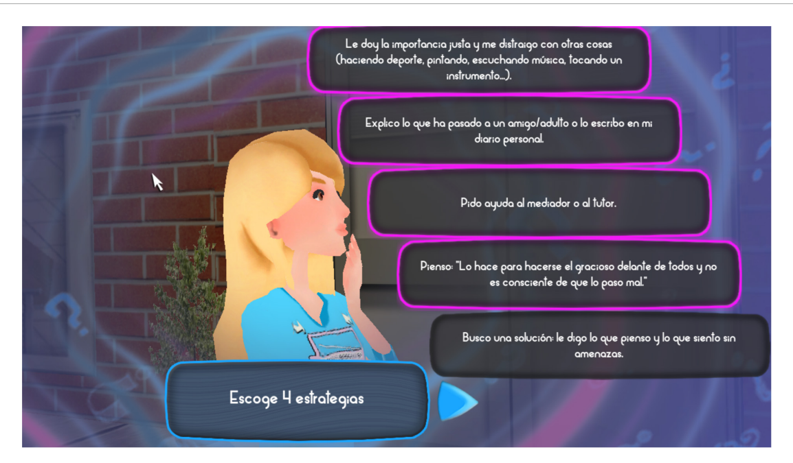
FIGURE 5 Image of the third step of the conflict resolution process in the software Happy 12–16, which shows the different regulation strategies to solve a conflict.

Quantitative data were analyzed with SPSS 27 software. Different analyses were carried out, including correlations among variables, regression, and implementation of the General Linear Model (GLM) for repeated measures. The results obtained and published in different articles (Filella et al., 2016; Cabello, 2018; Cabello Cuenca et al., 2019; Ros-Morente et al., 2019; Filella Guiu, 2022, among others) after a pre-post design with a control group showed that training with the Happy 8-12 software for an academic year significantly improves emotional skills and reduces students' levels of anxiety (p < 0.001 in both cases), improving at the same time other variables. Although the effect of this learning was discreet, it should be recalled that these variables-emotional skills and the social climate of the classroom-require an extended time and training to change completely and will not show definitive progress until more training is implemented.