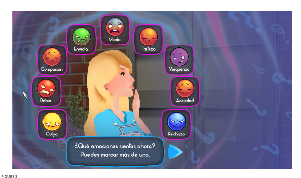
Image of the first step (Emotional awareness indicated in Figure 2 ) in the Happy 12–16 software.