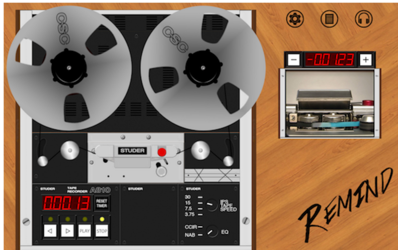
FIGURE 2 | The main graphic user interface of the REMIND app. A video of the original tape is shown outside the body of the tape recorder (top right inset) to improve its readability.

choice of whether or not the restoration should leave a trace of the source: voice and sounds recorded on a disc are linked to the noise of the disc, which is different from that of the tape. Different noises produced by a continuous transfer on different media leave a trace of the system that produced the document.