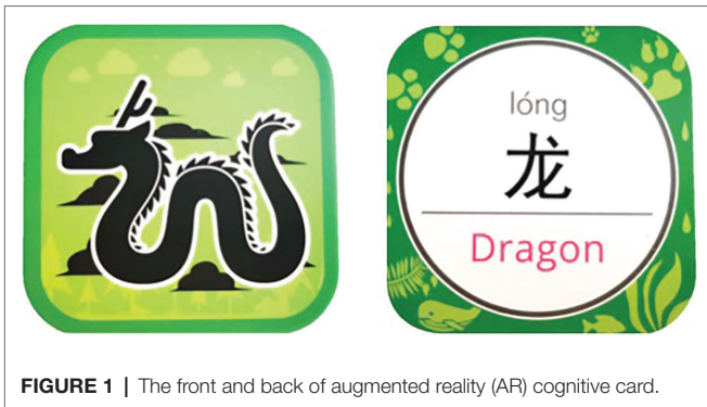
FIGURE 1 | The front and back of augmented reality (AR) cognitive card.