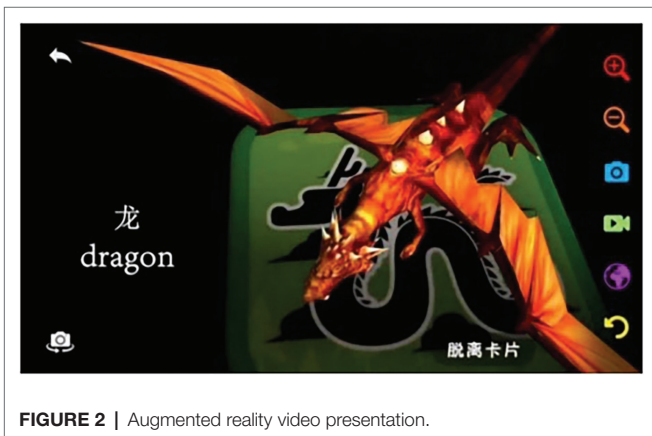
FIGURE 2 | Augmented reality video presentation.

learning effect; and previous studies have stated that there is a certain correlation between learning strategies and learning motivation. The two promote each other. Students with strong learning motivation will use more meta learning strategies, and the use of learning strategies will also enhance students' learning motivation (Sun and Meng, 2021). However, research on the relationship between the three is still relatively rare. Therefore, this study is expected to explore the influence of different types of learning modes and learning strategies on learning motivation, and use the experimental method to study whether the three learning strategies of restudying, retrieval practicing, and self-generated drawing have different effects on pupils' learning motivation under the presentation of two different learning materials of AR multimedia and traditional text. The possible reasons for the existence of different effects also will be discussed.