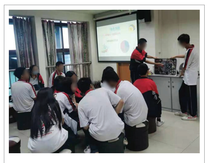
FIGURE 3 | The students participate discussion in the experiment.

information and emotions.<sup>[17]</sup> In terms of specific connotation, deep learning focuses on the transfer and application of knowledge, which not only requires students to have a high degree of ability to understand the content but also requires students to have a deep understanding of the learning situation. Only by grasping the key elements of the situation can we clarify the difference, and make accurate and clear judgments on the new situation, so as to realize the transfer and application of the principles and methods. At last, teachers should give supplementary explanations on some problems. This can arouse the enthusiasm of middle school students, let them discover the truth in practice, and finally let the students end the course in the exercise of concentration and curiosity.