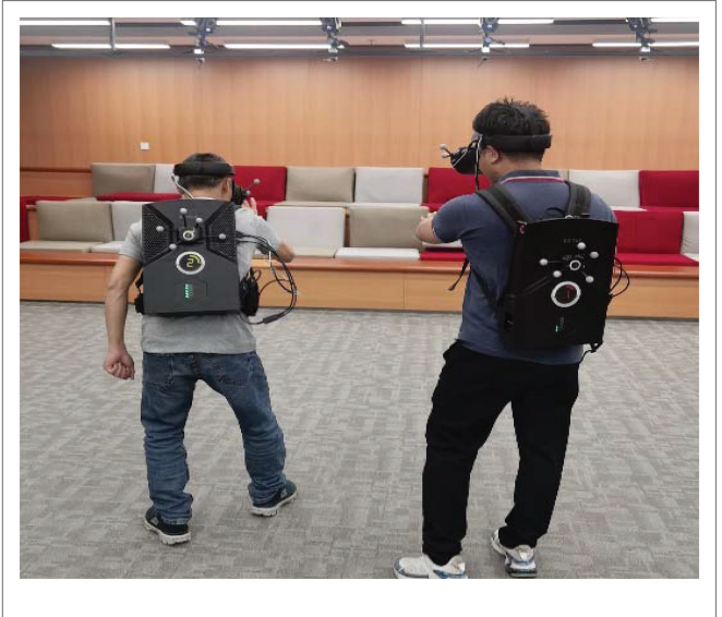
FIGURE 4 | Photos of students participating in the experiment.

TABLE 1 Paired 7-test results of students' creativity, distraction, and anxiety levels before and after AI and VR course training.