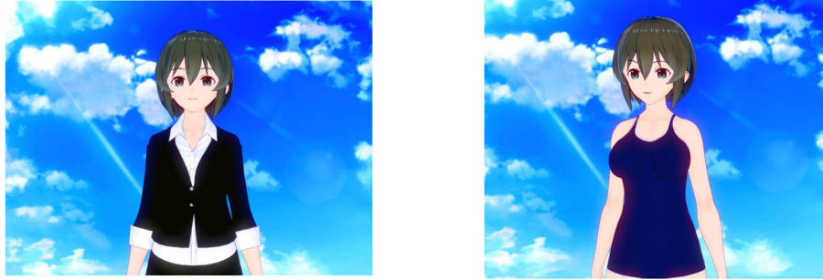
FIGURE 2 | The agent I used in the experiment. The left agent is used for business suit conditions, and the right is for swimsuit conditions.