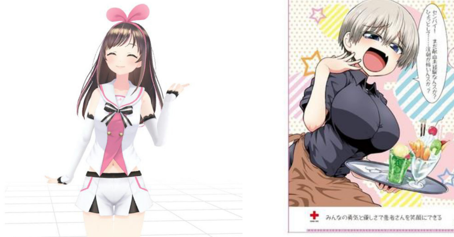
FIGURE 1 | Left: Kizuna AI ( https://kizunaai.com/). Right: Uzaki-chan's collaboration art with Japanese Red Cross for blood donation campaign.