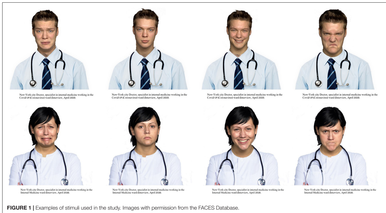
FIGURE 1 | Examples of stimuli used in the study.

of the physician independent of whether they treated patients with COVID-19 or not. This is somewhat at odds with findings that expressions of anger signal more competence than sad expressions (Tiedens, 2001).