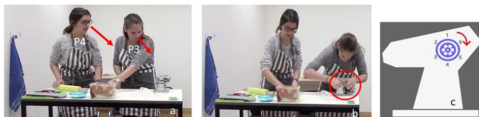
FIGURE 2 | Example of exploration questions while learning how to use tools.

Food preparation is a meaningful real-world task that can boost creativity (McCabe and de Waal Malefyt, 2015) and have a positive impact on the self-esteem of people (Farmer et al., 2018). When food preparation occurs collaboratively, it strengthens social bonds by reinforcing family relationships, initiating and