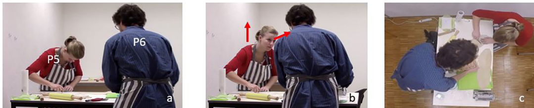
FIGURE 3 | Example of confirmation question in joint decision-making.

P5: Je coupe là? Shall I cut there? *is about to cut the dough* Fig.3a P6: ° Eu:h ouais °= Uh yeah P5: = On est d'acco:rd? (.4) Do we agree? *lifts head and looks at P6* Fig.3b P6: Ouais (.2) >sinon on refera après< Yeah, Otherwise we will do it again after *nods* *P5 cuts the dough.....* Fig.3c