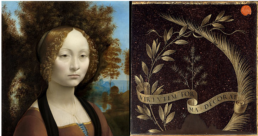
FIGURE 1 | Leonardo da Vinci's portrait of Ginevra de' Benci and the reverse side of the painting.

women are target of a perfection bias—namely, are evaluated on the ground of multiple dimensions—also when their personality traits are inferred from facial appearance.