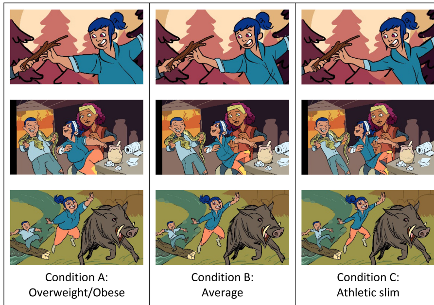
FIGURE 1 | Image stills taken from the narrative trailer for each of the three body shape conditions. Produced by FableVision Studios for Northeastern University. Reproduced with permission from Northeastern University.

(to the nearest 0.1 cm) using a ShorrBoard (Weight and Measure, LLC, Olney, MD, United States) and weight (to within 0.1 kg) using a SECA scale (SECA Inc., Chino, CA, United States). A third measurement was taken if there was more than a 0.2 cm (height) or a 0.2 kg (weight) difference between the first two measurements. Afterward, the demographic information previously provided was confirmed. Body mass index was calculated using the mean of height and weight measurements ( BMI; kg/m^2 ) and using the CDC growth charts (Kuczmarski et al., 2000). The children were then randomly assigned to watch one of three animation clips: one-third assigned to condition A, one-third to condition B, and one-third to condition C. The height and weight assessment, randomization, and actual data collection were within 1–2 weeks to ensure the timeliness and accuracy of the measurements.