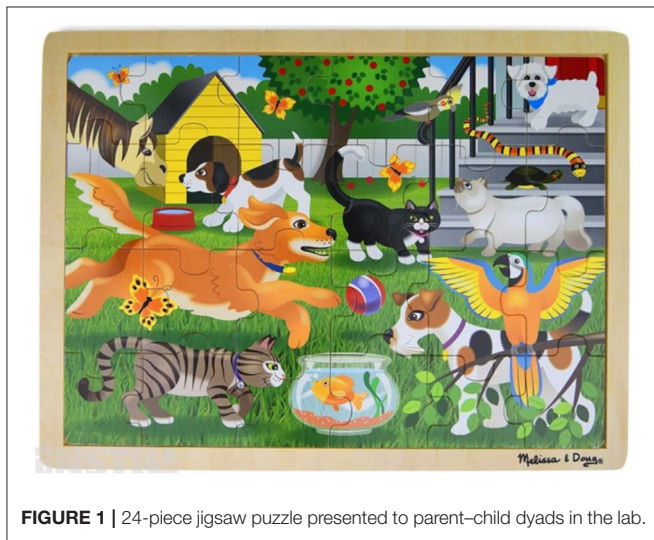
FIGURE 1 | 24-piece jigsaw puzzle presented to parent-child dyads in the lab.