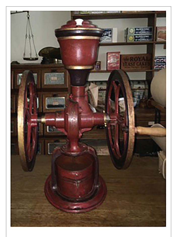
FIGURE 2 | Coffee grinder used in this experiment.

adults and children as young as 5-year old rated characters who provide mechanistic explanations about mechanical machines as more knowledgeable than those that provide non-mechanistic explanations (Lockhart et al., 2019) and believe this mechanistic knowledge should be generalizable to related machines (Chuey et al., 2020). This suggests that children privilege mechanistic explanations, therefore prompting children to focus on mechanisms, will increase their talk about mechanisms and lead them to recall more mechanistic information at test.