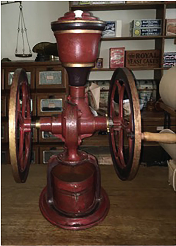
FIGURE 2 | Coffee grinder used in this experiment.

adults and children as young as 5-year old rated characters who provide mechanistic explanations about mechanical machines as more knowledgeable than those that provide non-mechanistic explanations (Lockhart et al., 2019) and believe this mechanistic knowledge should be generalizable to related machines (Chuey et al., 2020). This suggests that children privilege mechanistic explanations, therefore prompting children to focus on mechanisms, will increase their talk about mechanisms and lead them to recall more mechanistic information at test.