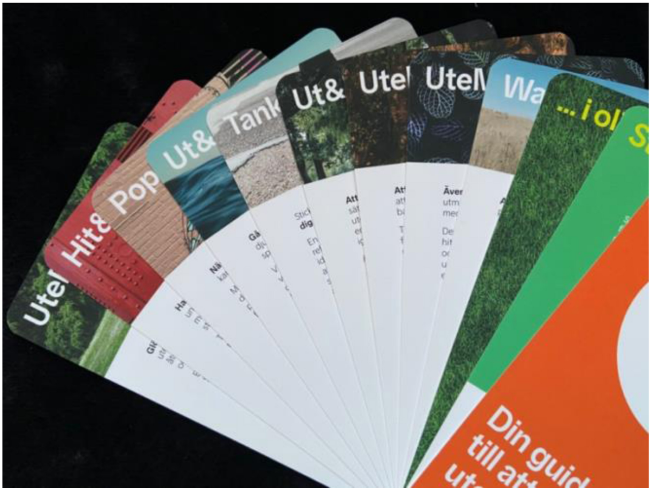
FIGURE 1 | The pocket-booklet describing different forms of outdoor office work launched at the end of the interactive research project.

kind of places they used and preferred. The research seminars were made up by an introductory lecture, where the researchers involved (the co-authors) presented their research perspectives. The seminar continued with a group discussion, preceded by a “walk-and-talk” in smaller groups, about what had been learnt and could be taken into account for the process of exploring outdoor office work onward. See Figure 2 , for an overview of the formalized learning process and their themes, as well as the data generated.