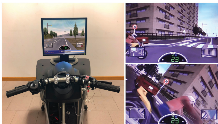
FIGURE 1 | The HRT simulator with an example of risky scene before and during the crash.

Session 2: Participants had to ride along two new routes of urban roads (different from each other) in Fog conditions with feedback (Feedback/Fog). Because of the adverse climatic conditions (foggy day), they were instructed to ride respecting a lower speed limit of 30 km/h. In this session, a visual feedback was provided when the limit was exceeded.