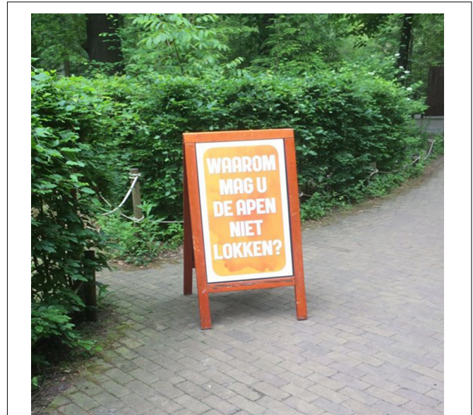
FIGURE 2 | Sign with question: “why should you not lure the monkeys?”.

intimidates the monkeys,” “luring disrupts the natural behavior of the monkeys” and “luring disrupts the strict rank that exists within the (monkey) group” (see Figure 1 ). The arguments were formulated after consulting (animal) experts of the Primate Park 2 . Second, we systematically varied whether or not the question “Why should you not lure the monkeys?” was presented to the visitors through one large (71.5 cm × 138.5 cm), noticeable sign right before the entrance of the free-ranging area (see Figure 2 ).