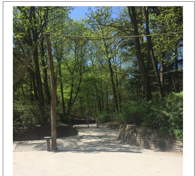
FIGURE 3 | Observation area.

To observe visitors rule compliance behavior, we selected an area of 4 by 15 m in the middle of the free-ranging area (see Figure 3 ). Specifically, this was an area which all visitors would certainly walk through, where there were many possibilities for visitors to