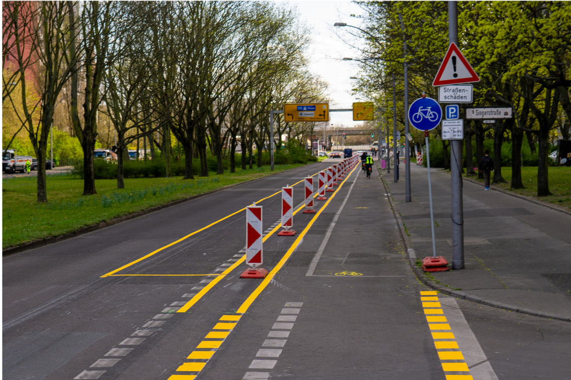
FIGURE 1 | A “pop-up bike lane” in Berlin-Kreuzberg, built at the beginning of the corona crisis in 2020.