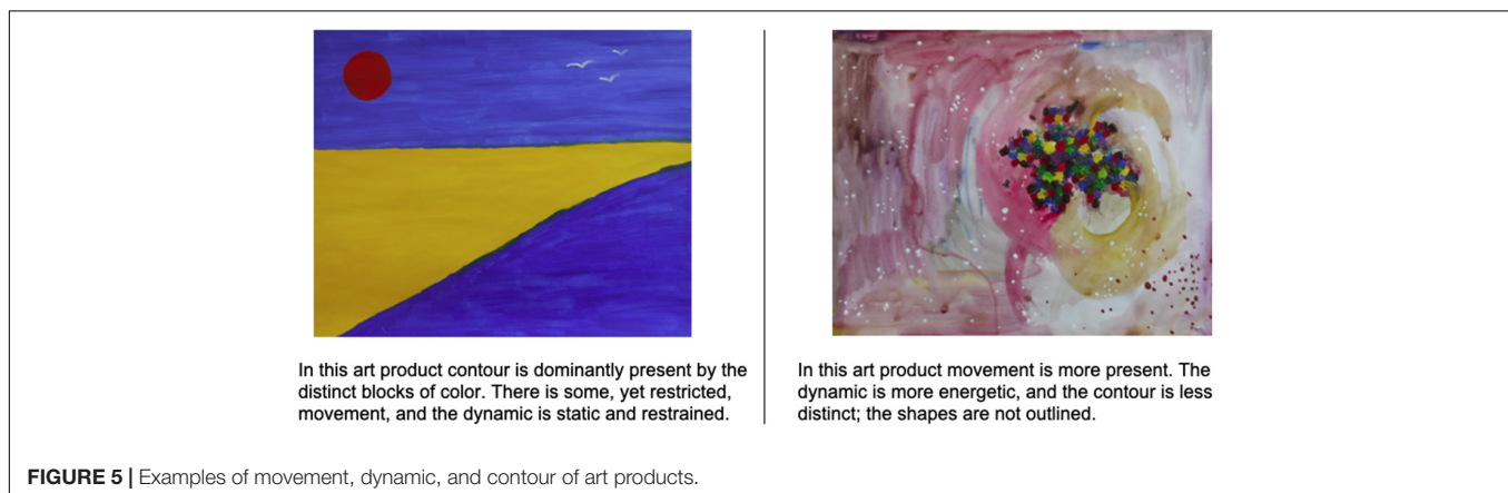
FIGURE 5 | Examples of movement, dynamic, and contour of art products.

diagnoses, 18 clients had a dual-diagnosis, nine clients had triple-diagnoses, and three clients four or more diagnoses. Most frequently diagnosed DSM categories were personality disorder (31 clients, 67%) and mood disorder (27 clients, 62%).