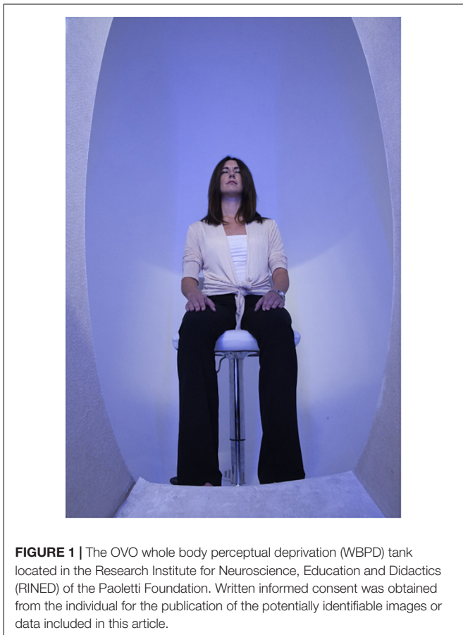
FIGURE 1 | The OVO whole body perceptual deprivation (WBPB) tank located in the Research Institute for Neuroscience, Education and Didactics (RINED) of the Paoletti Foundation. Written informed consent was obtained from the individual for the publication of the potentially identifiable images or data included in this article.

The subjective reports, which included both open-ended descriptions of the experience during the session and answers to the semistructured interview conducted at the end of the session, were given to five independent judges, having no familiarity with the participants. In the full report of these data (Glicksohn et al., 2019), we focused on three categories: valence (positive vs. negative), mode of thinking (verbal vs. imagistic), and state of consciousness (reflective vs. trancelike). The judges were given the printed reports, together with a coding sheet specifying these categories, and had to make