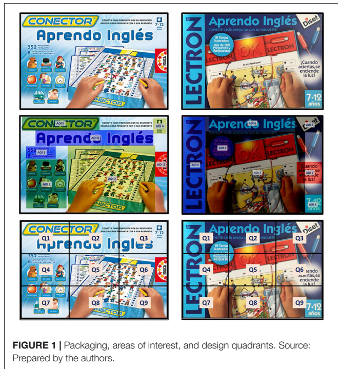
FIGURE 1 | Packaging, areas of interest, and design quadrants.