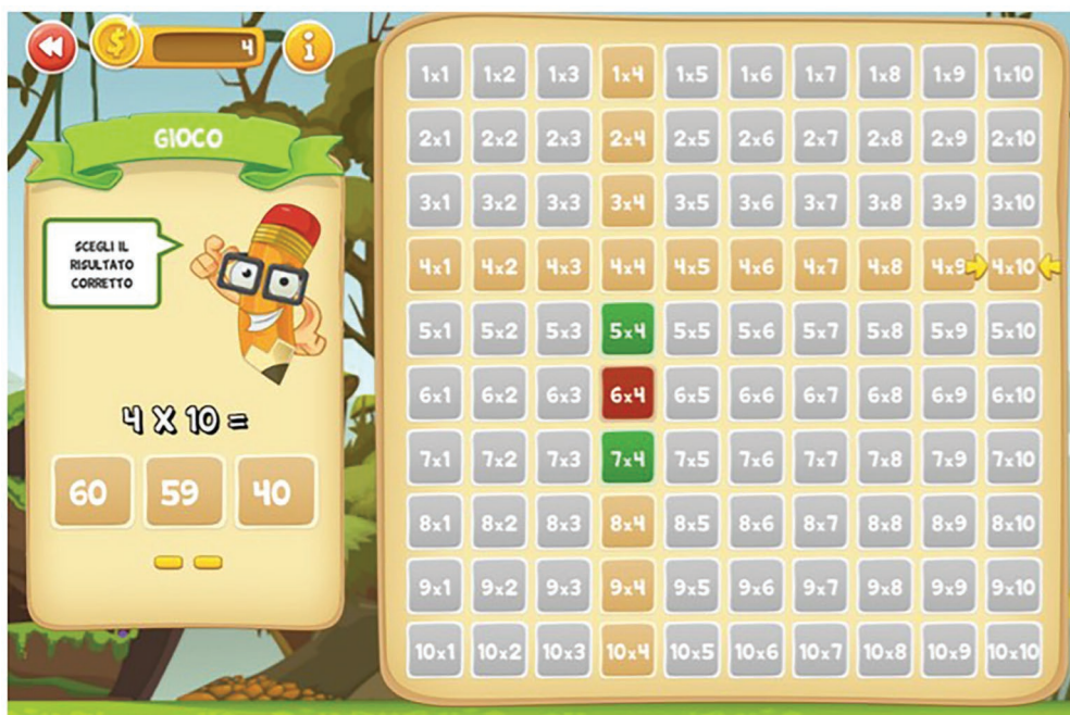
FIGURE 3 | Example of game phase of the Web App “I bambini contano.”

terms of arithmetic fact skills, which were the main target of the training program. Additionally, we measured for improvement on mental calculation and written operation tasks, hypothesizing