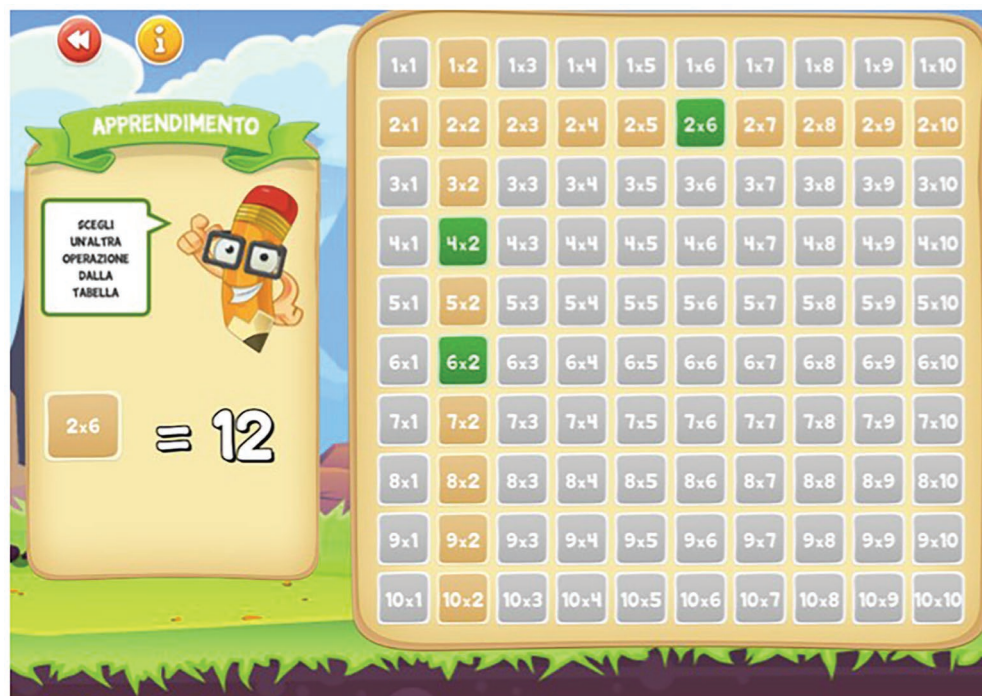
FIGURE 1 | Example of learning phase of the Web App “I bambini contano.”

Pre- to post-training improvement as well as the students’ performance in the follow-up were specifically measured in