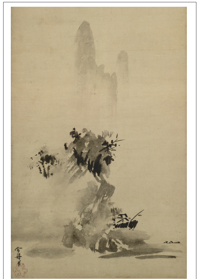
FIGURE 2 | Splashed Ink Landscape (破墨山水) Haboku sansui by Sesshū Tōyō (1420–1506). Image attribution: Sesshū (1495), Tokyo National Museum, Tokyo, Japan (Wikimedia Commons).

This is reflected in the philosophical commitments entailed by each approach. Whereas ecological psychology adhered to a kind of Jamesian monism, the enactive approach aimed to carve a path between dualism and monism. While this distinction held for early versions of the ecological and enactive approaches, it has become less relevant as they developed further. Whereas early enactivists rejected monism, contemporary enactivists have adopted neutral monism (Thompson, 2001, see also Chemero, 2009, pp. 184–186). This is significant because contemporary ecological psychologists also accept neutral monism, and argue