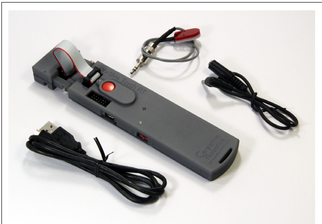
FIGURE 3 | Photo of the Enactive Torch Research Tool (ETRT). We made use of ETRT v1.0. Note that for this study we turned the sensor head upwards at a 90° angle so that subjects were given vibrotactile sensations corresponding to the objects placed on top of the experimental box, as illustrated in Figures 2, 3 . The photo also shows the data cable and a cable with a small actuator and its extension cable for external vibrotactile output. For this study we transferred data to the laptop computer via Bluetooth and employed the vibrating actuator built into the ETRT itself.