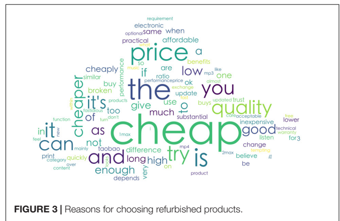
FIGURE 3 | Reasons for choosing refurbished products.